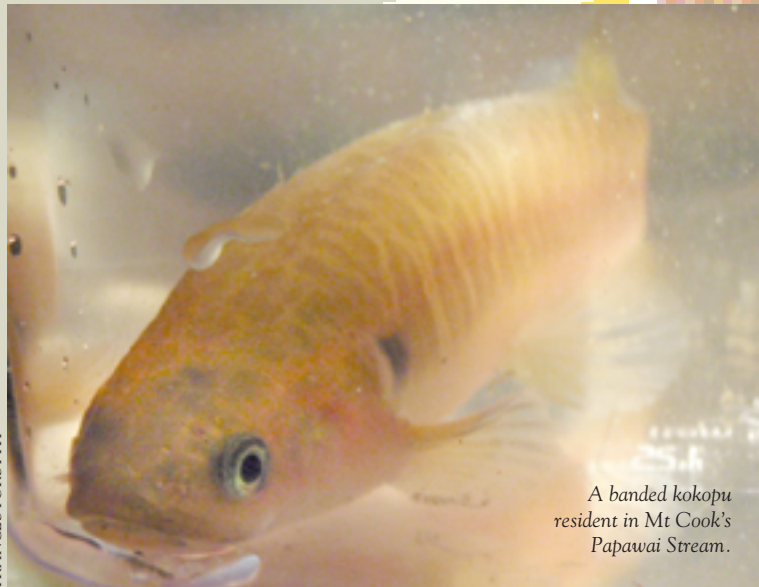
A banded kokopu resident in Mt Cook's Papawai Stream.