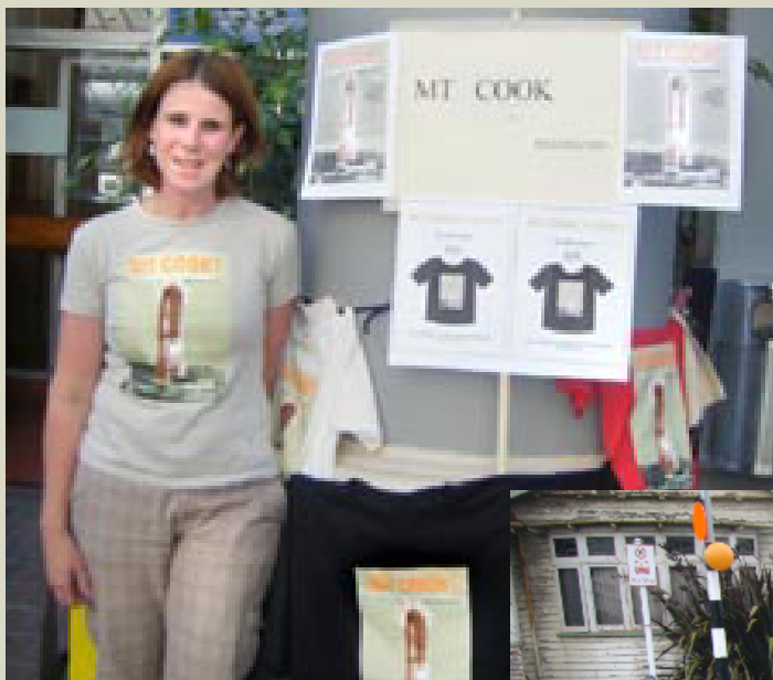
Above The MCM stand and a MCM person at Massey's Orientation.

Submissions on these draft proposals have closed, and the Council will now decide on specific changes to the District Plan in the light of those submissions. Further submissions on those changes will be sought by the Council later in 2009.